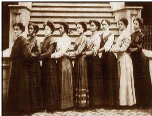
Graduates, Normal Department New Orleans University, 1909 From New Orleans Catalog, 1909

The materials in the AARC are for in-house use only and cannot be checked out.